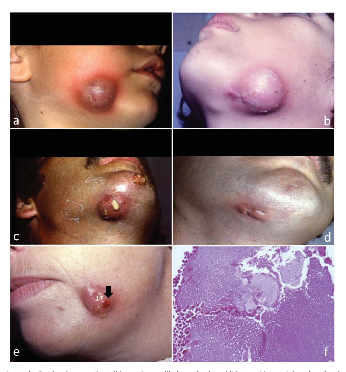
Figure 2. Cervicofacial actinomycosis. Solid mass in mandibular region in a child (a) and in an adult patient (b); the nodule becomes fistulated, with draining pus (c), which can lead to scarring after treatment (d); within the material discharged through the fistulae, it is possible to see the sulfur granules (e, arrow) corresponding to the Actinomyces colonies (f, HE, 400X).

Actinomyces shows filamentous or diptheroidal morphology, where the latter forms seem like non-pathogenic diphteroid Propionibacteria and the thin filaments exhibit V or Y ramifications and bacillary or coccoid forms (5). Colonies are visible by light microscopy with hematoxylin-eosin (H&E) (7). Grocott-Gomori-methenamine (5,7), methylene-blue, Gram or periodic acid-Schiff staining (PAS) (5), Methylene-blue, Gram, PAS and Grocott-Gomori staining disclose mycelial ramifications and Gram-positive filaments, which can be mistaken for streptococcus (5). With